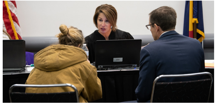
Denver County Court Judge Nicole Rodarte presides during Homeless Court at Project Homeless Connect. *