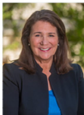
U.S. Representatives Diana Degette