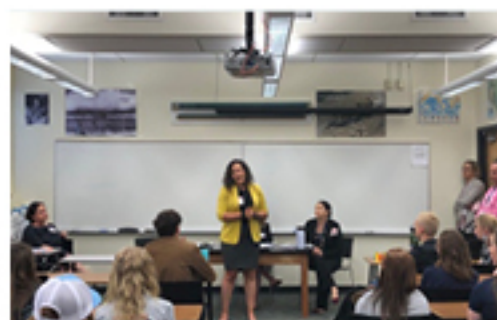
Hate Crimes Mock Trial

After two years with only virtual presentations, it was nice this year to return to in-person events. Volunteers with the Task Force present a fictional trial on Colorado's Hate Crimes/Bias Statute at local middle and high schools. If you want to volunteer or know of a school that would welcome this free program, let us know. To learn more about how you can get involved, visit the CLC website.