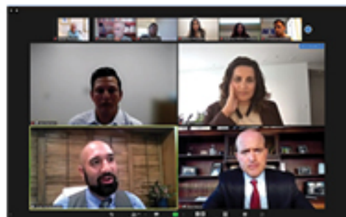
2021 Racial Justice Summit

In September 2021, the YLD held its first annual Racial Justice Summit on criminal justice in partnership with the DU Sturm College of Law. The (virtual) event was a great success; a recording of the summit is available on the CLC website. Plan to join us for the 2022 Racial Justice Summit on September 29, 2022 from 4 to 7 p.m. at DU Sturm College of Law. The topic will be voting rights and racial justice.